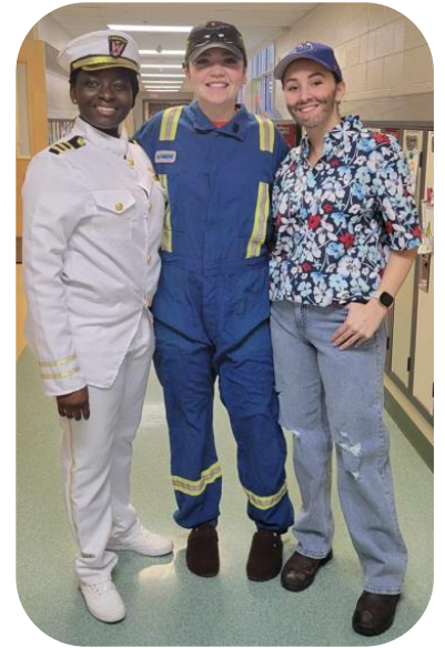
Dress Like Family Day!