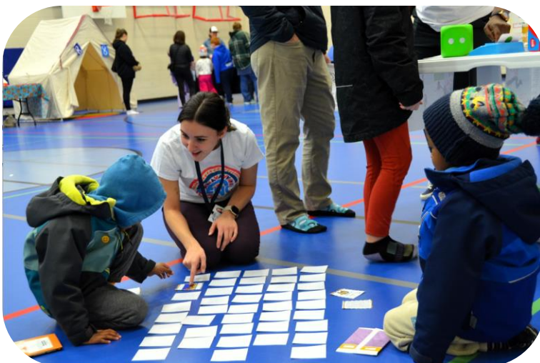
Literacy Night Fun