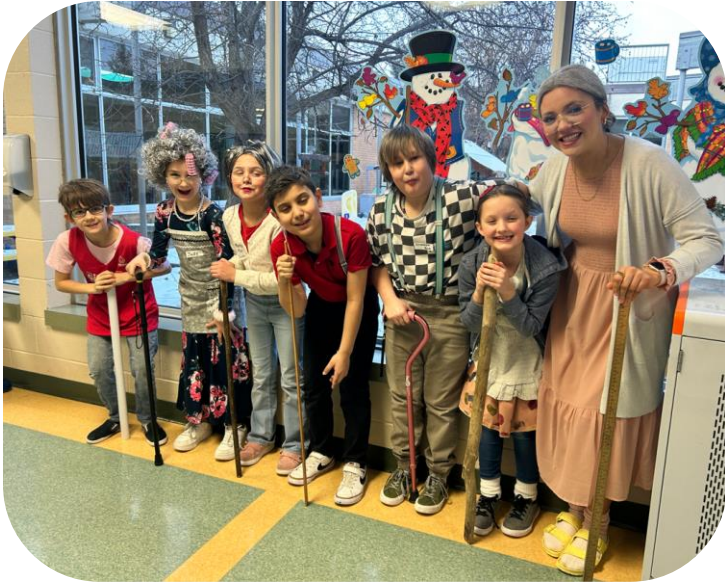
100th Day of School!