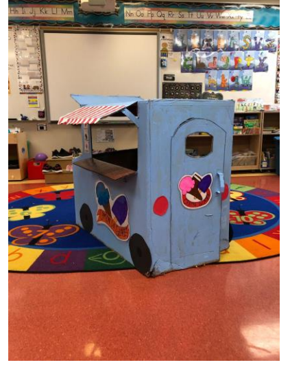
Fun things happening in Mlle Luce's kindergarten class!