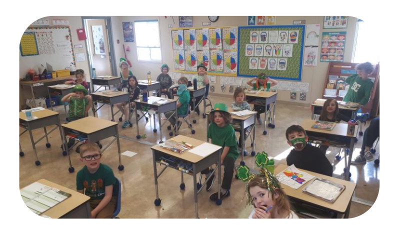
St. Patrick's fun With Gr. 1L!